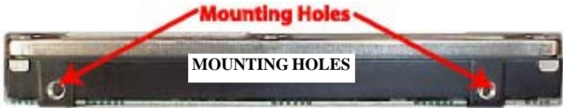
FIGURE 2 – MOUNTING HOLE LOCATIONS